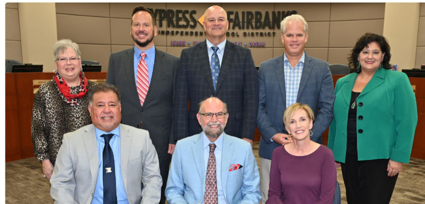
Board of Trustees